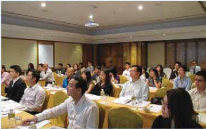
▲ Class in session

Continuous Professional Development (CPD) hours have been granted for all sessions to date so call us if you are interested or access our website: www.ppkm.org.my