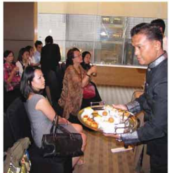
▲ Networking over some wine and canapés