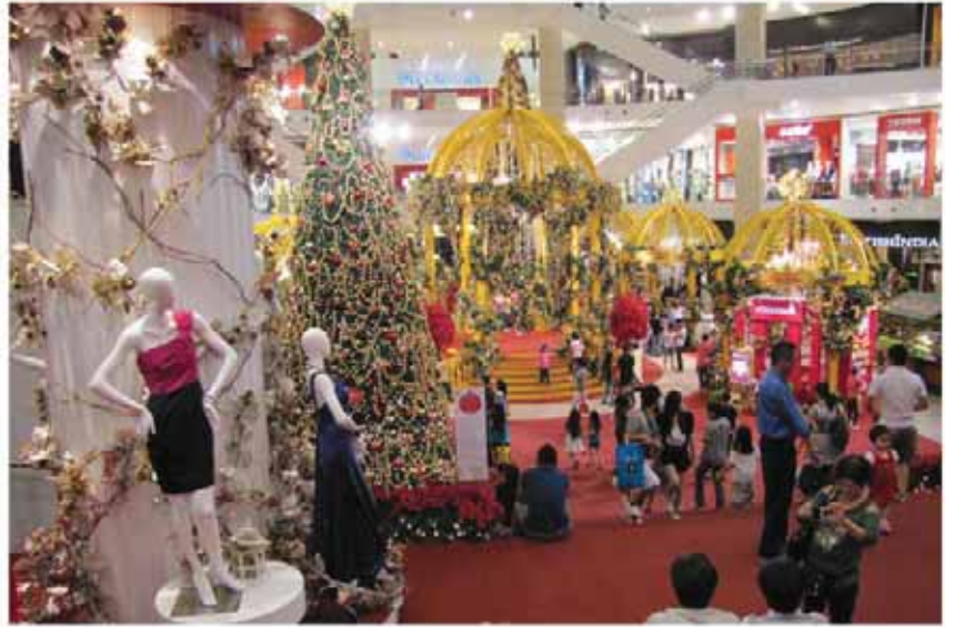
▲ Find Christmas Enchantments at Pavilion KL