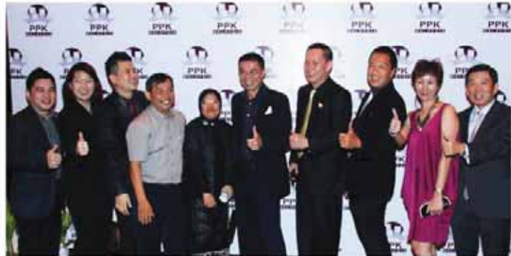
▲ A reunion of sorts ..we are/were colleagues, some time or other !!