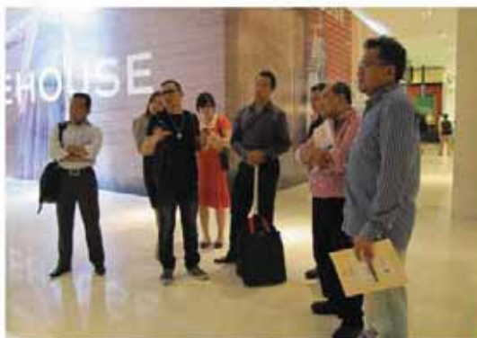
▲ The judges in action