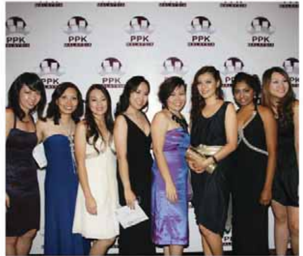
▲ Pretty faces from Sunway Pyramid at the photo wall