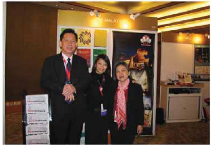
▲ Welcome to a little of Malaysia in Beijing !