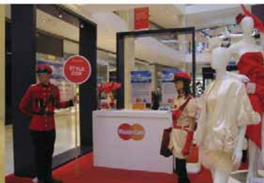
▲ Super Stylish Fashion cops at Pavilion Kuala Lumpur