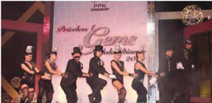
▲ Code Entertainment dancers giving the high kicks