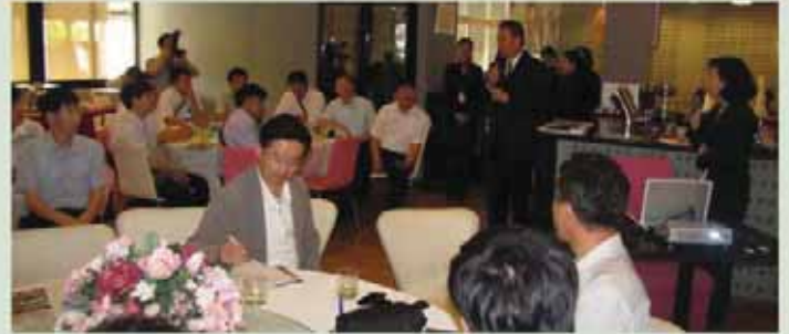
▲ Anyong-haseyo ! Sunway Pyramid hosted the meeting with 27 members of KBOMA who were in town for a visit. It is hoped that we can foster closer ties and possibly invite them to join Council of Asia Shopping Centres (CASC) since we have touched base.