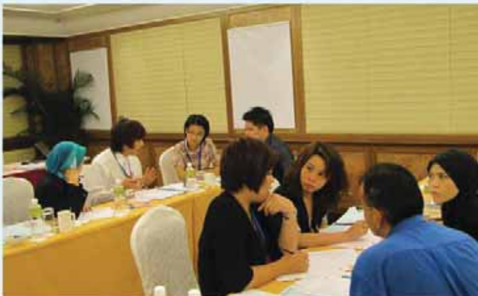
▲ New ideas during the workshop