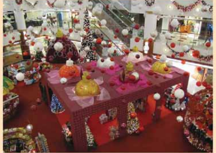
▲ There's magic at Bangsar Shopping Centre