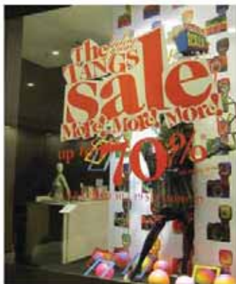
▲ The winning retailer from Tangs Pavilion