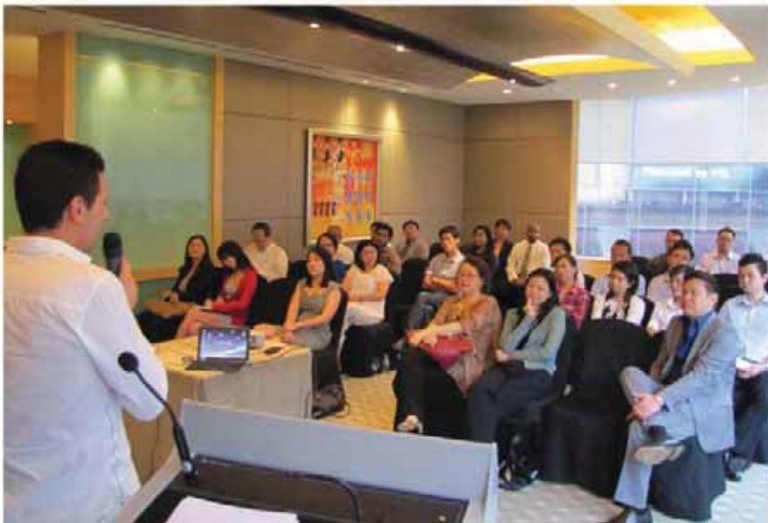
▲ Keen attention during the presentation on festive lighting

In partnership with International Council of Shopping Centres (ICSC), PPKM invited Klang Valley malls to a talk on Festive Lighting and Illumination by MK Illumination AG. Especially when our malls celebrate many festive seasons, the illuminated decorations drew strong interest.