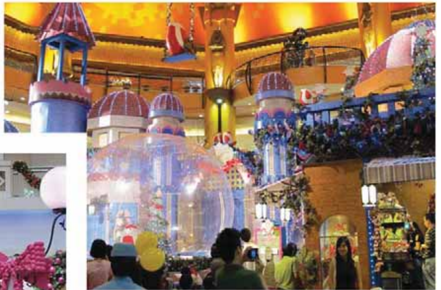
▲ Christmas fantasia at Sunway Pyramid