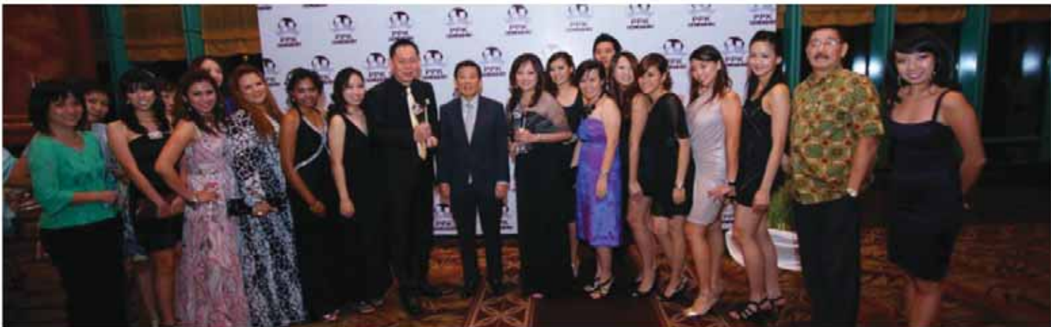
▲ Sunway Pyramid are the winners, too !