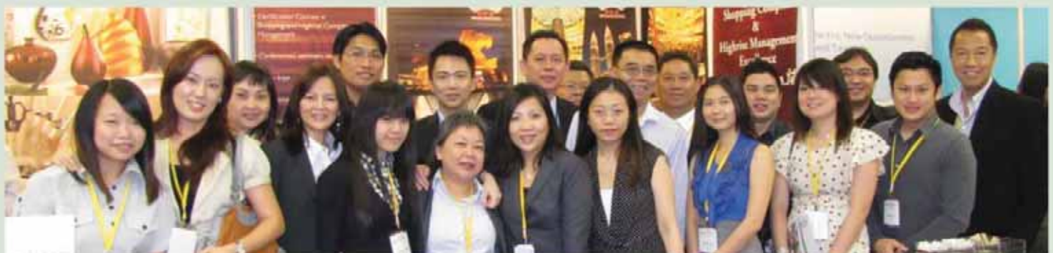
▲ A strong Malaysian delegation