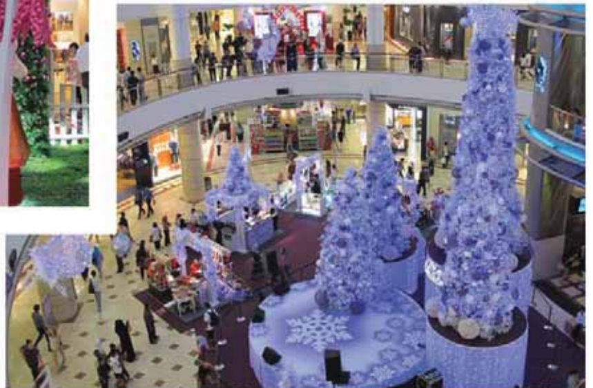
▲ Suria KLCC's Merriest Christmas