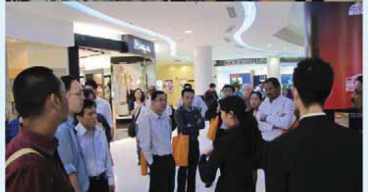
▲ Site visits to the front and back-of-house