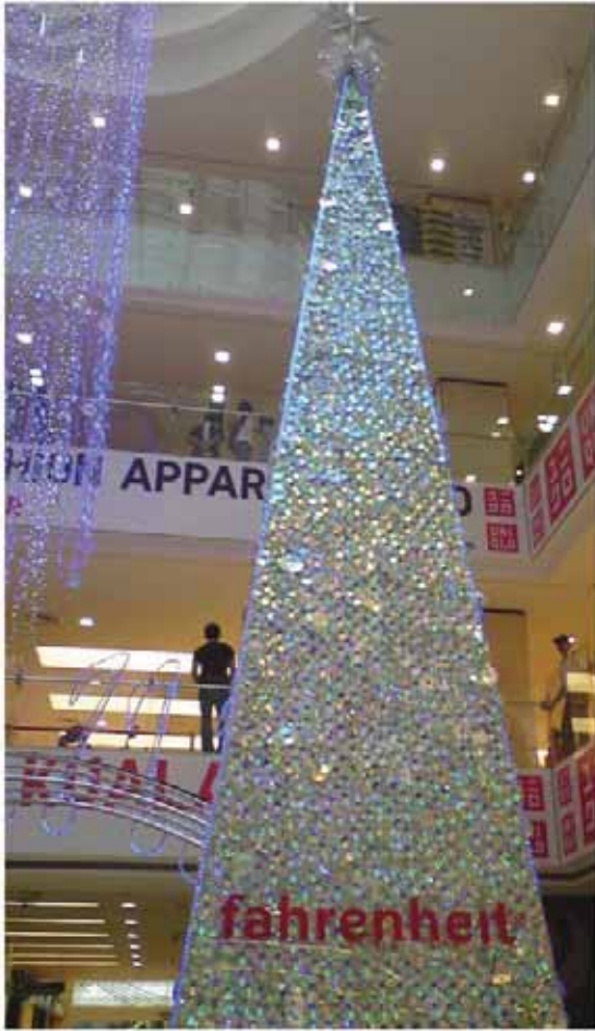
▲ Rockin' Christmas at Fahrenheit88