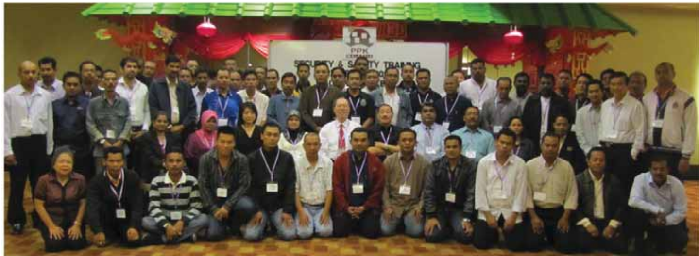
▲ The training session drew much enthusiastic response !

Held at Cititel Mid Valley City, PPKM's Safety and Security lessons attracted many Klang Valley and outstation participants. A word of thanks to our 'gurus' who dedicated their time and shared their knowledge and understanding on safety and security procedures for shopping centres.