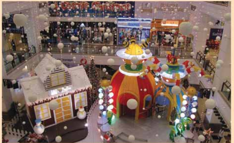
▲ It's A Cosmic Christmas for Berjaya Times Square