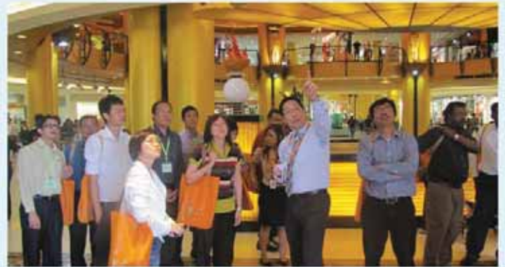
▲ It's a bit difficult but not impossible to reach up there ..