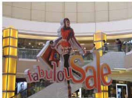
▲ It's a FabulousSale at Sunway Pyramid