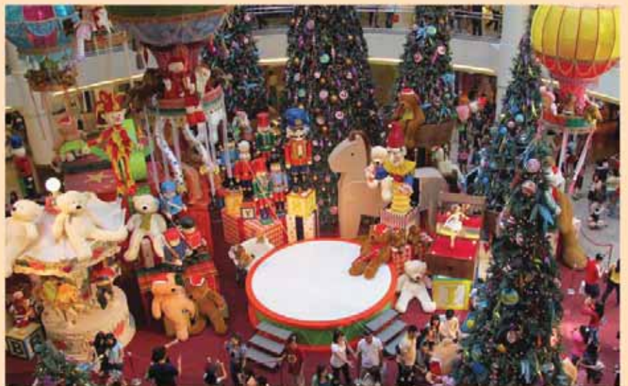
▲ Have a Funtoystic time at Mid Valley Megamall