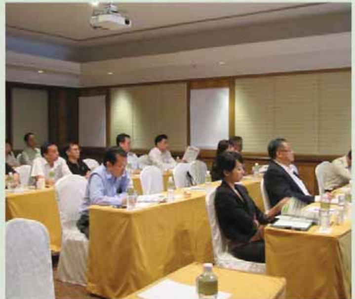
▲ The eco minded mall representatives