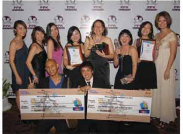
▲ Pavilion KL gets the awards (and the windfall) !