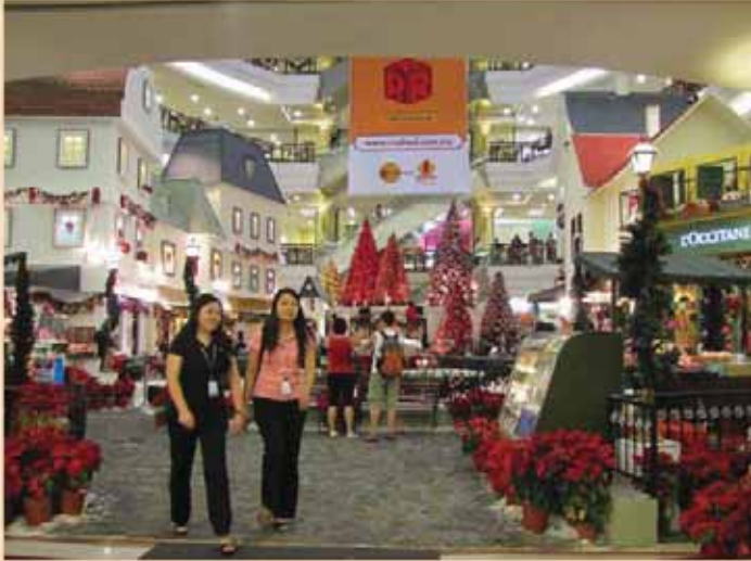
▲ Come Home to I Utama

We bring you snapshots of the year end festive season which is all over town, inside the malls and outside ~