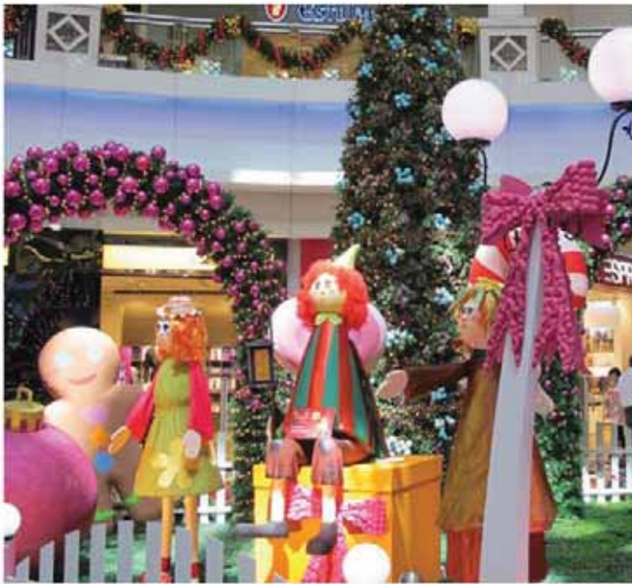
▲ The Curve's Toy Town