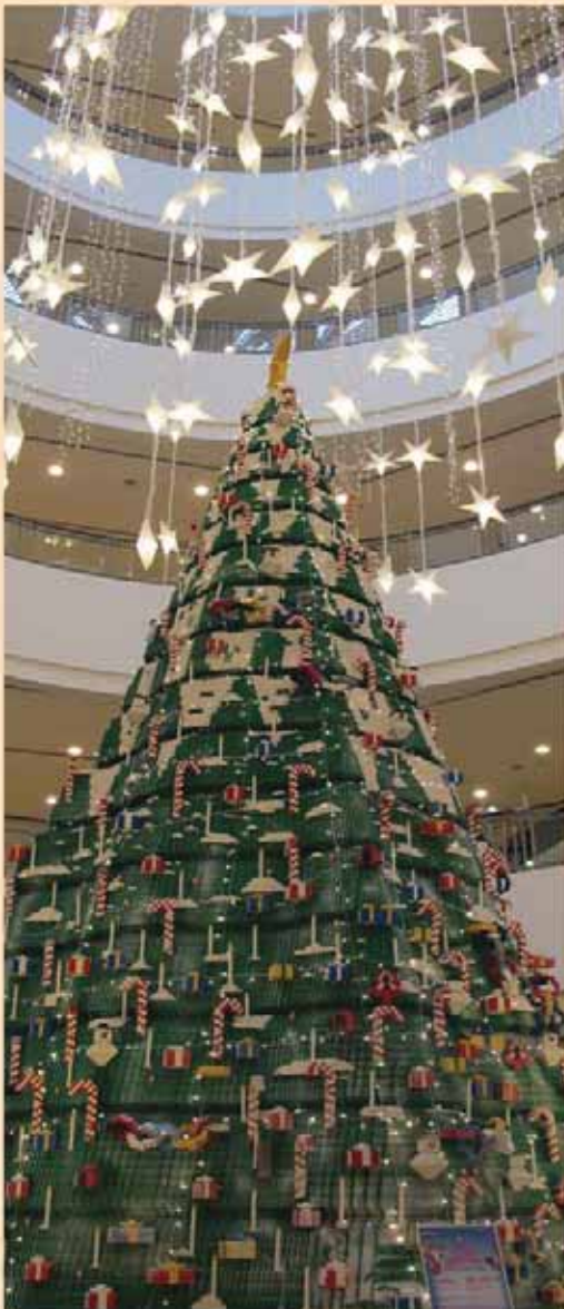
▲ Bangsar Village's having a Lego Christmas