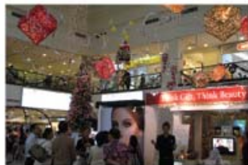
▲ Glittering presents hung aglow at Bangsar Village