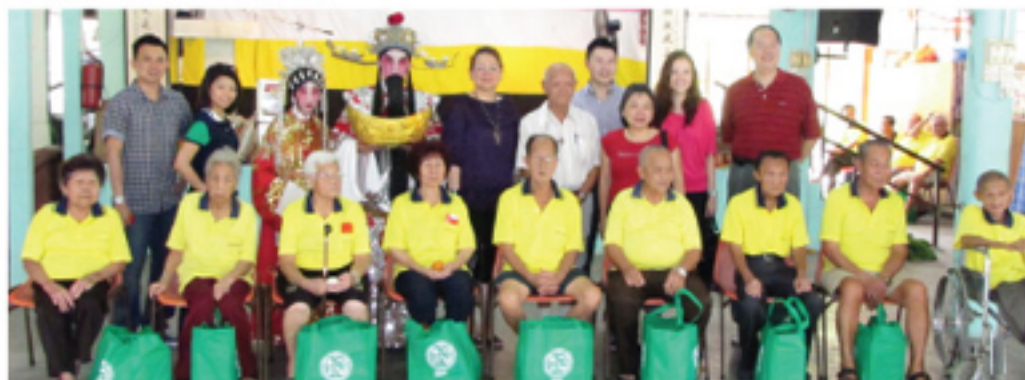
▲ PPK team with some of the seniors