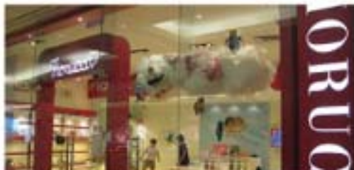
▲ Fiorucci, The Gardens garnered the award for specialty shops