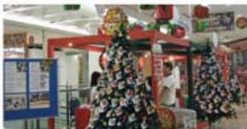
▲ IOI Mall, Puchong believes that charity begins at home