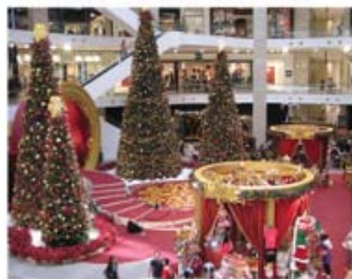
▲ Pavilion Kuala Lumpur goes 'royale' with its plush décor, winning the Best in Thematic Decoration (CBD category)