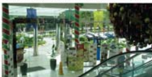
▲ Santa Claus comes to The Sphere at Bangsar South