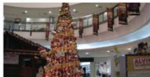
▲ A Chipmunks Christmas @ Mines

Congratulations to all the commendable winners and a word of appreciation to all participants!