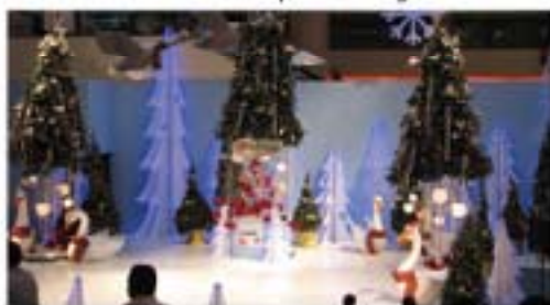
▲ Shoppers are welcomed by swans at Sungei Wang Plaza