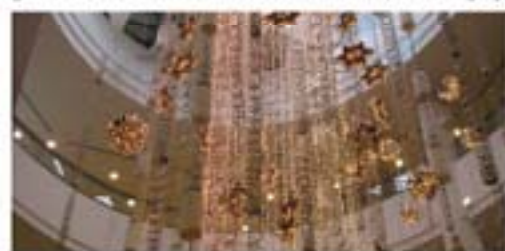
▲ Bangsar Village II goes creative with décor from recycled items