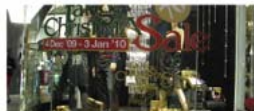
▲ The winning department store: Tang's Pavilion Kuala Lumpur