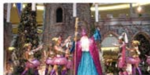
▲ A Merry Magical Christmas at Mid Valley Megamall garnered the Best in Promotions and Events (CBD category)