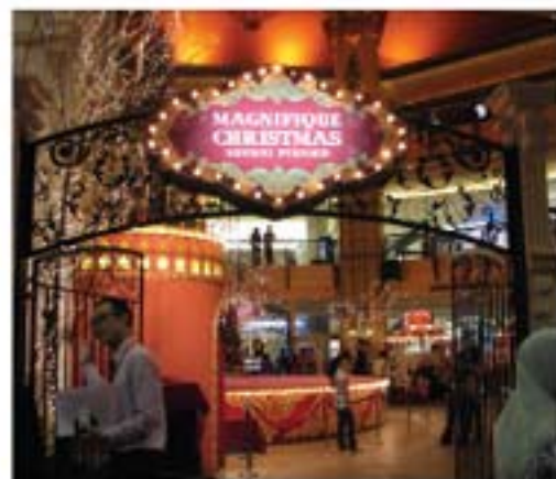
▲ An all-French atmosphere with a tropical twist at Sunway Pyramid's Magnifique Christmas, winner for both awards in the Suburban Category