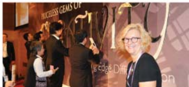
▲ Always creative, always innovative – at the inimitable opening gimmick