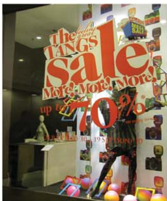
▲ The winning retailer from Tangs Pavilion