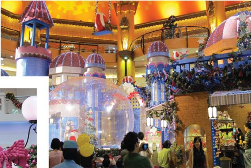
▲ Christmas fantasia at Sunway Pyramid