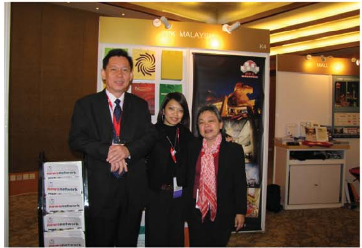
▲ Welcome to a little of Malaysia in Beijing !