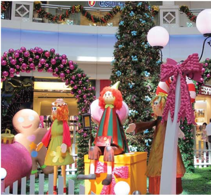
▲ The Curve's Toy Town