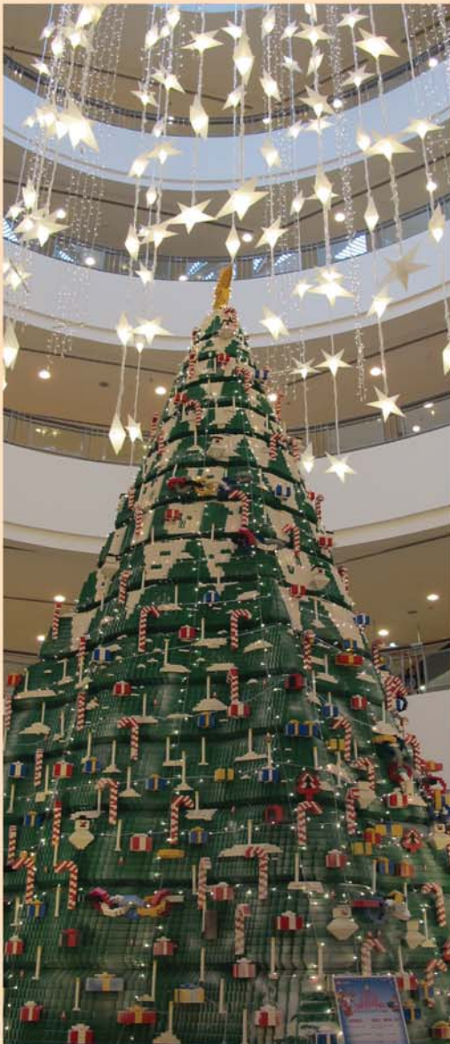
▲ Bangsar Village's having a Lego Christmas