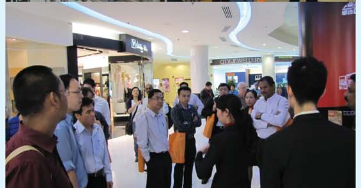
▲ Site visits to the front and back-of-house