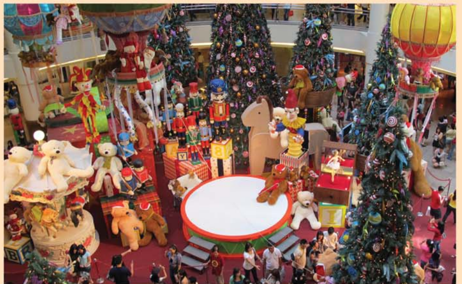
▲ Have a Funtoystic time at Mid Valley Megamall