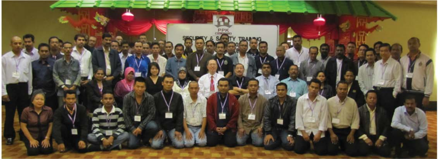
▲ The training session drew much enthusiastic response !

Held at Cititel Mid Valley City, PPKM's Safety and Security lessons attracted many Klang Valley and outstation participants. A word of thanks to our 'gurus' who dedicated their time and shared their knowledge and understanding on safety and security procedures for shopping centres.