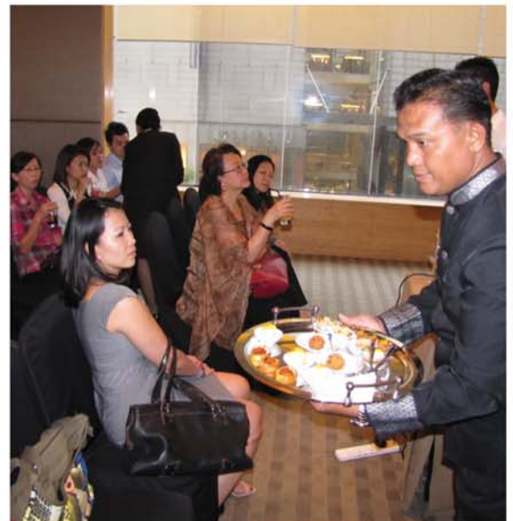
▲ Networking over some wine and canapés