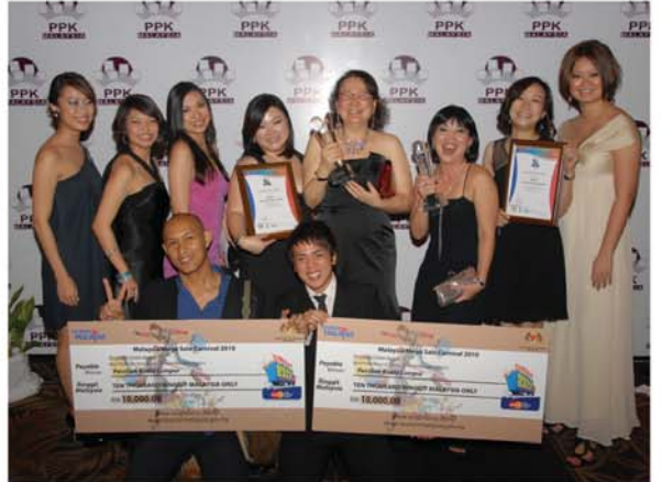
▲ Pavilion KL gets the awards (and the windfall) !