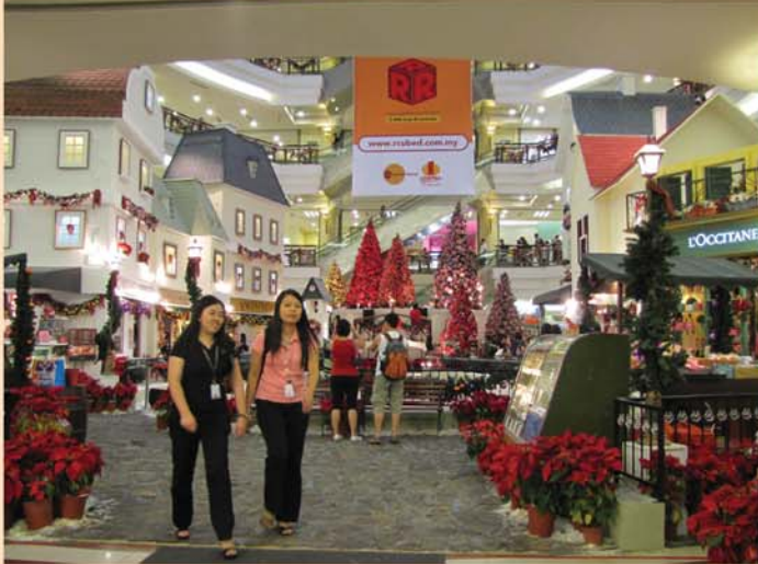
▲ Come Home to I Utama

We bring you snapshots of the year end festive season which is all over town, inside the malls and outside ~