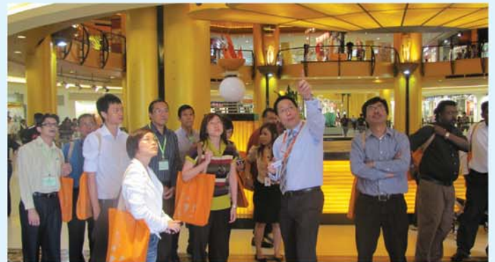
▲ It's a bit difficult but not impossible to reach up there ..