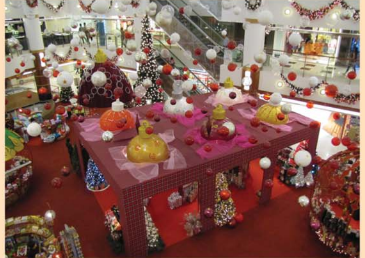
▲ There's magic at Bangsar Shopping Centre