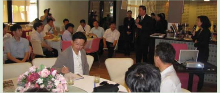
▲ Anyong-haseyo ! Sunway Pyramid hosted the meeting with 27 members of KBOMA who were in town for a visit. It is hoped that we can foster closer ties and possibly invite them to join Council of Asia Shopping Centres (CASC) since we have touched base.