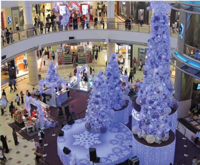
▲ Suria KLCC's Merriest Christmas