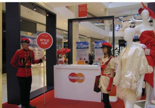
▲ Super Stylish Fashion cops at Pavilion Kuala Lumpur