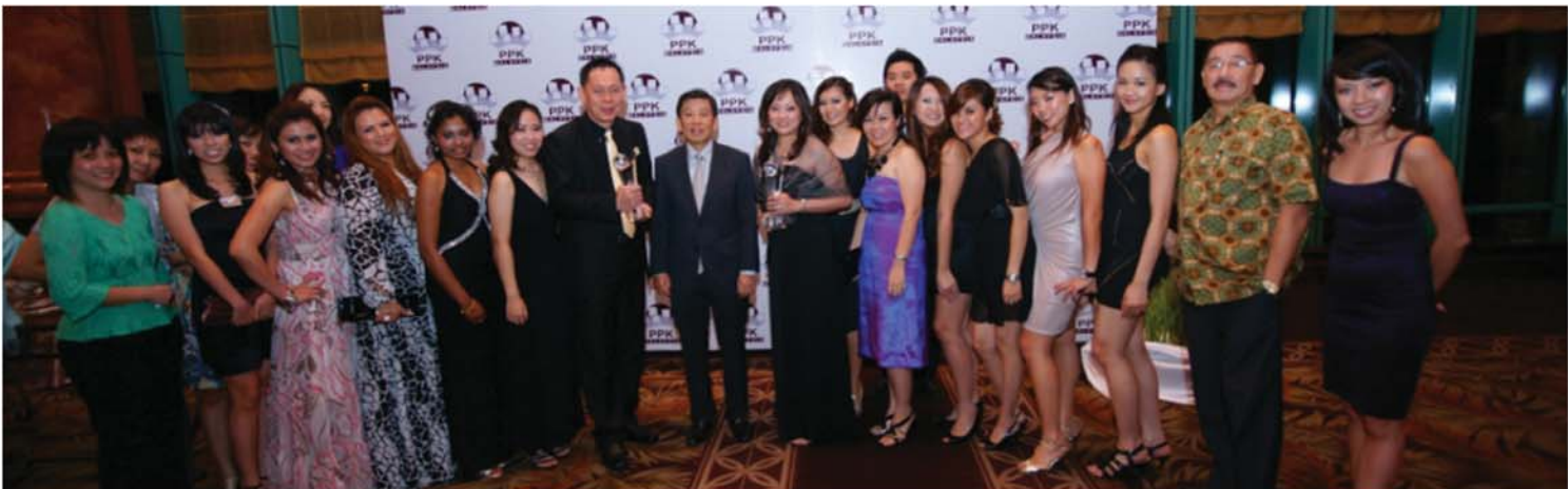
▲ Sunway Pyramid are the winners, too !