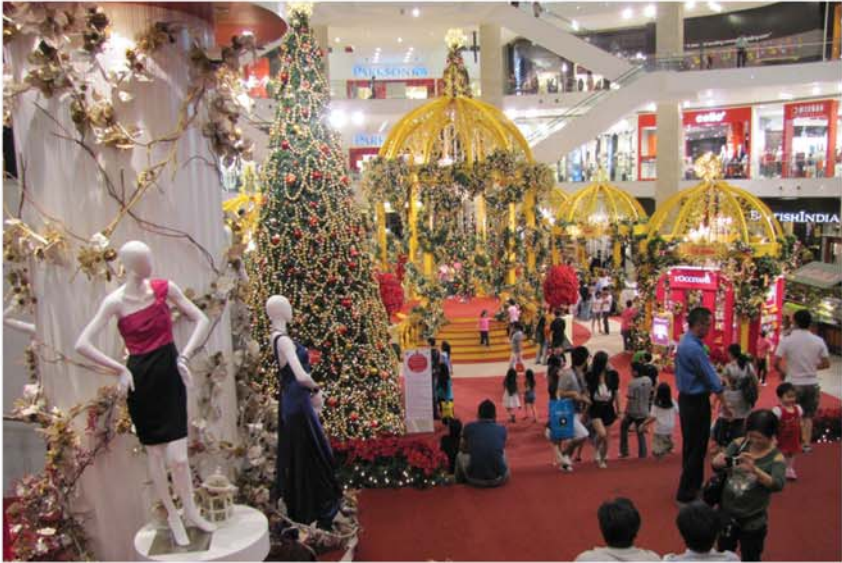
▲ Find Christmas Enchantments at Pavilion KL