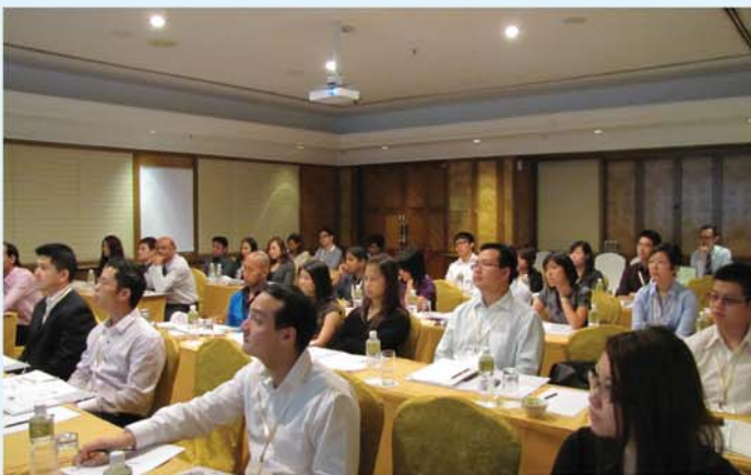
▲ Class in session

Continuous Professional Development (CPD) hours have been granted for all sessions to date so call us if you are interested or access our website: www.ppkm.org.my