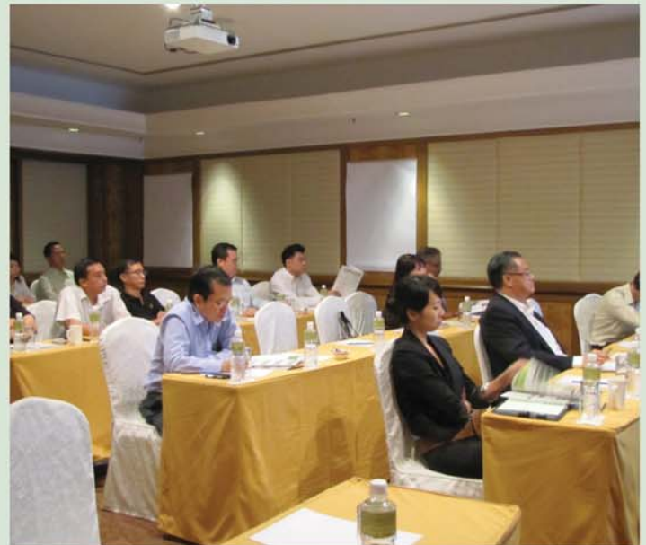
▲ The eco minded mall representatives