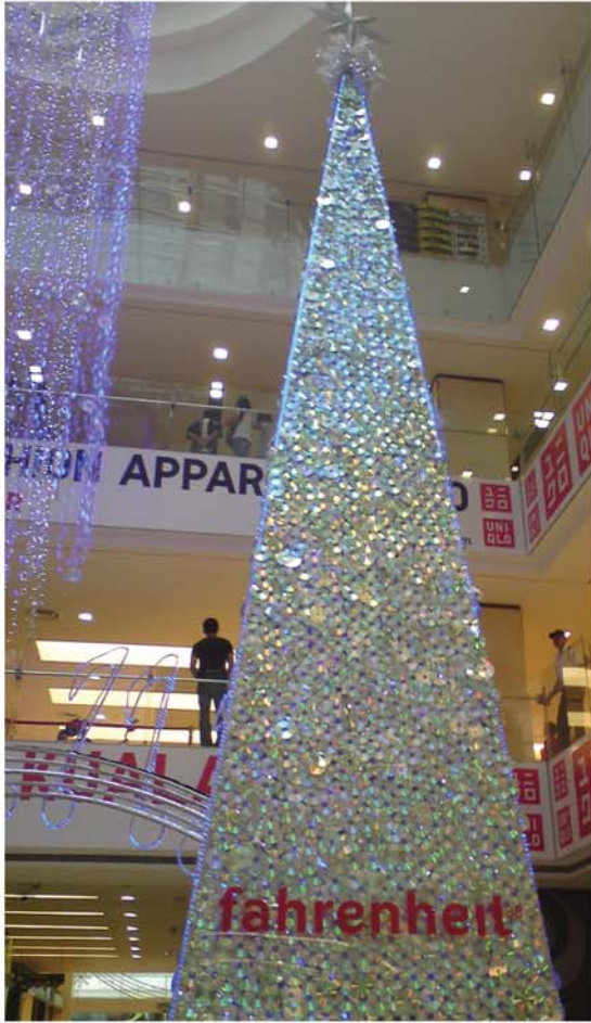
▲ Rockin' Christmas at Fahrenheit88