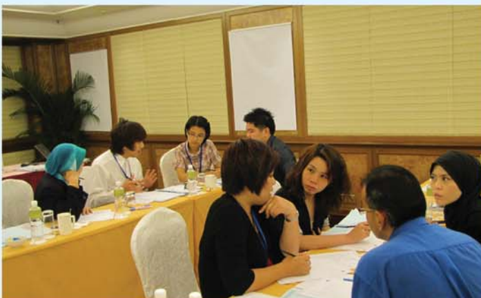
▲ New ideas during the workshop