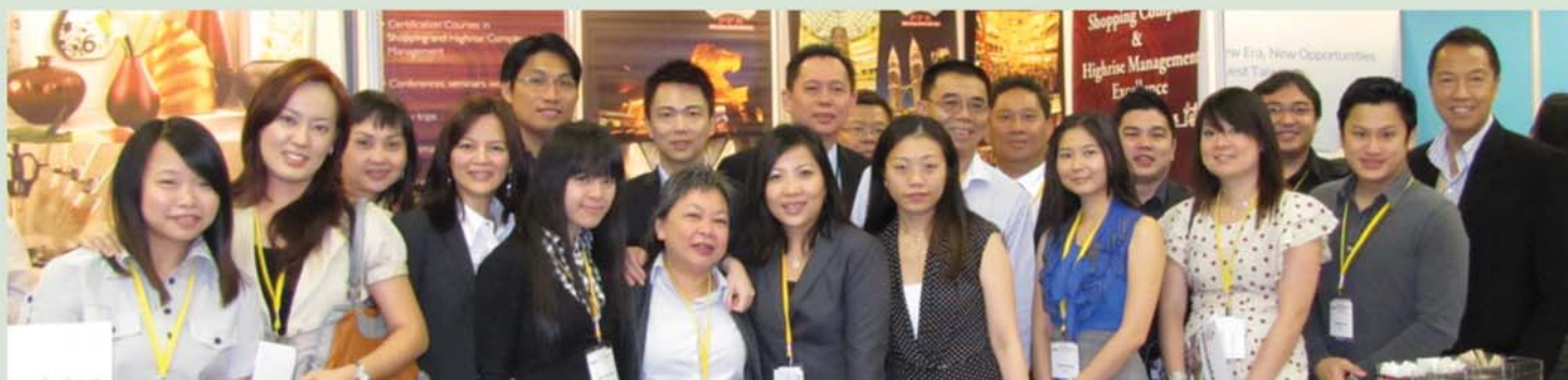
▲ A strong Malaysian delegation