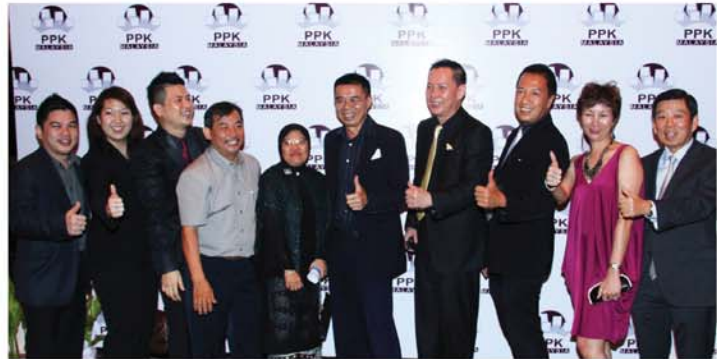
▲ A reunion of sorts .. we are/were colleagues, some time or other !!