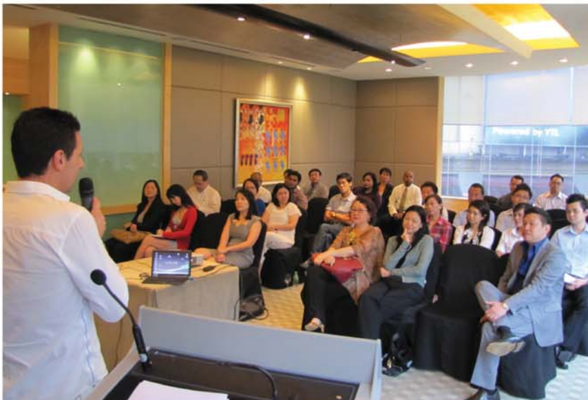
▲ Keen attention during the presentation on festive lighting

In partnership with International Council of Shopping Centres (ICSC), PPKM invited Klang Valley malls to a talk on Festive Lighting and Illumination by MK Illumination AG. Especially when our malls celebrate many festive seasons, the illuminated decorations drew strong interest.