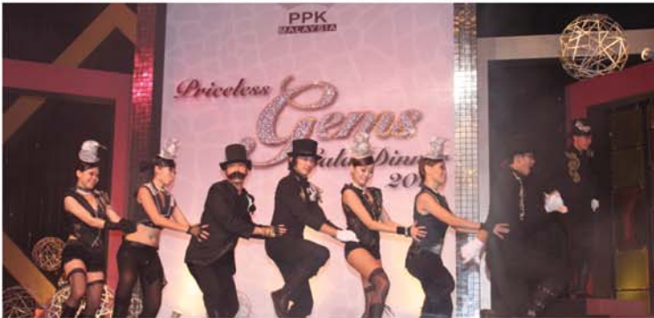
▲ Code Entertainment dancers giving the high kicks