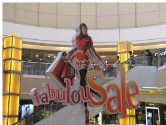
▲ It's a FabulousSale at Sunway Pyramid