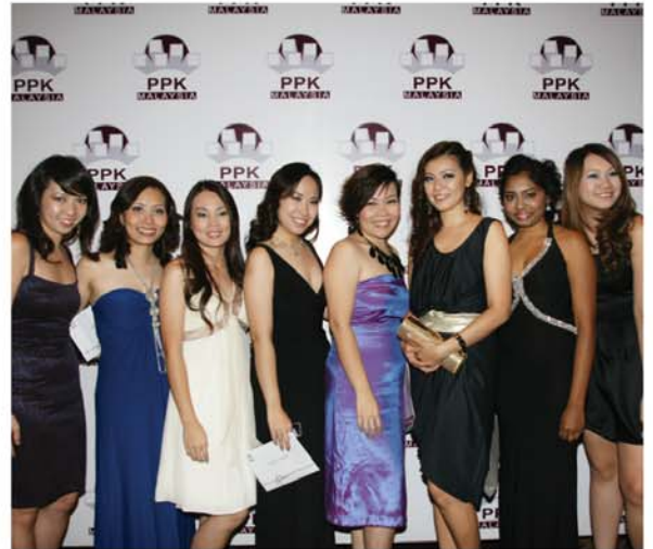
▲ Pretty faces from Sunway Pyramid at the photo wall