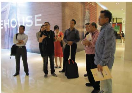
▲ The judges in action