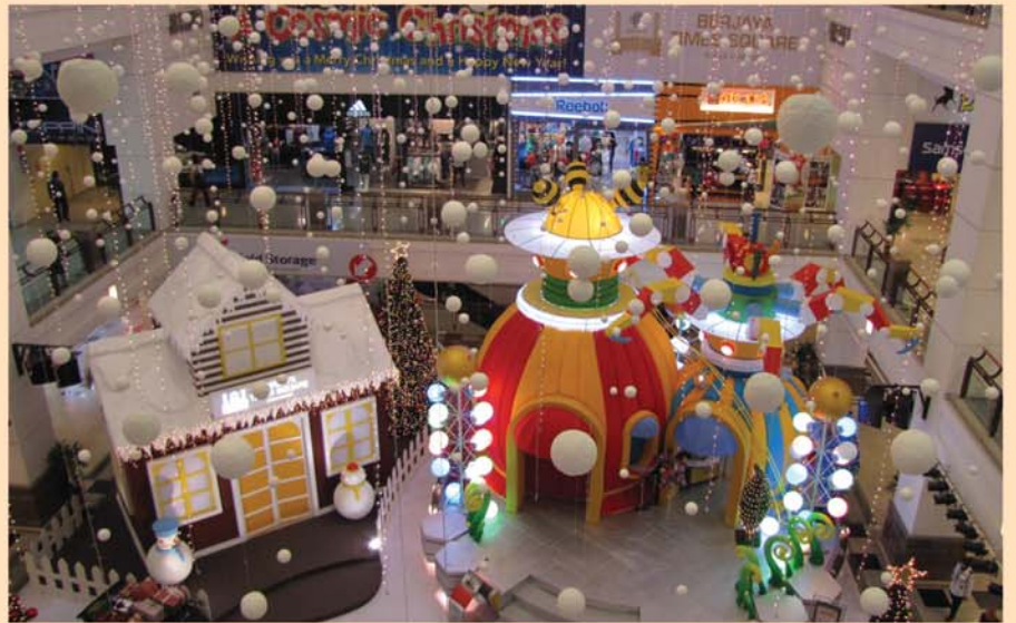
▲ It's A Cosmic Christmas for Berjaya Times Square