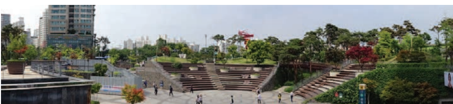
The Sunflower Park at D'Cube City Mall