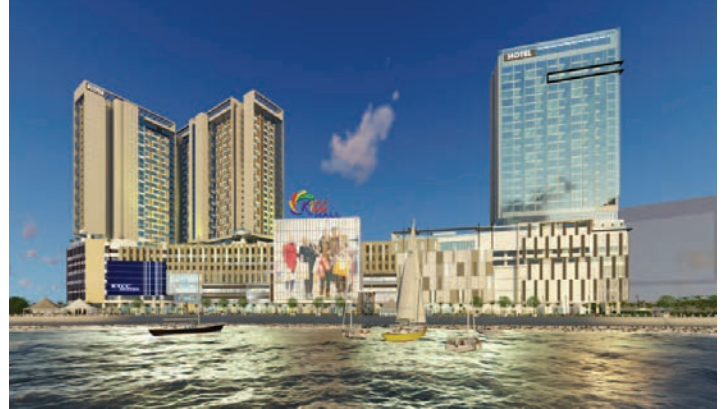
Artist's impression of KTCC MALL

Slated to soft open in October 2019, KTCC MALL forms part of a mixed seafront project under the East Coast Economic Region development plans. Like the other five shopping malls in Peninsular Malaysia developed by the award-winning Mall of Malaysia Group, which specialises in building community lifestyle malls, KTCC MALL has also been designed with a one-stop concept in mind.