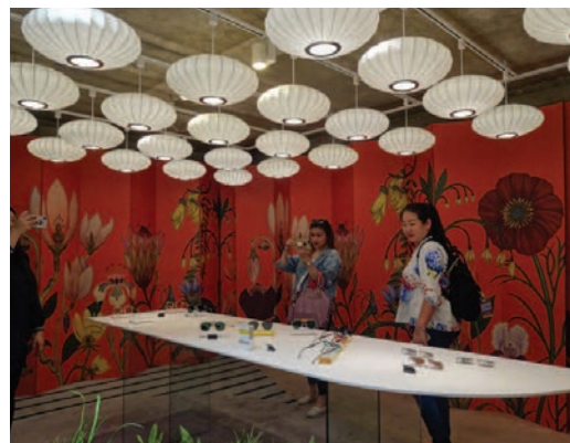
Impressive décor at Gentle Monster's flagship store