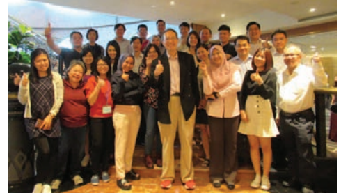
'Yes!' for the Administration module