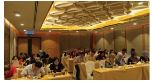
Part 3 candidates in various modules getting ready for their written exam

COMING SOON: The second session will continue from 5-10 August at Pavilion Hotel Kuala Lumpur. Don't worry if you are busy and miss this session, we will run similar repeat courses in April and August 2020.