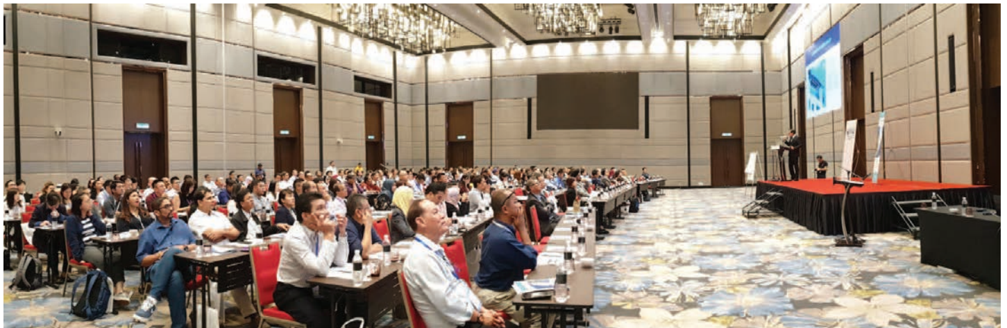
Held at Avante Hotel, Petaling Jaya and themed Good Governance and Good Practices in a Developed Economy, the seminar attracted more than 250 participants

FIABCI Malaysia and PPK Malaysia (Malaysia Shopping Malls Association) have been co-organising several similar seminars since the inaugural event in 2006 and this year’s was the 11th in this popular series, previously known as the ‘Property Management Time Bomb’ seminars.