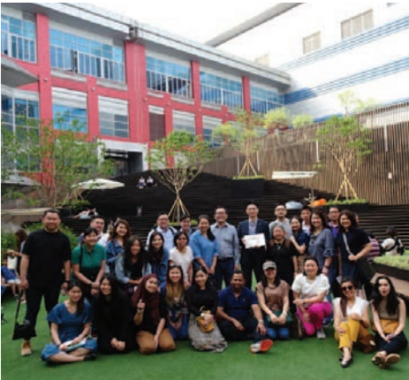
Posing for the camera at the Urban Nature park of I-Park Mall