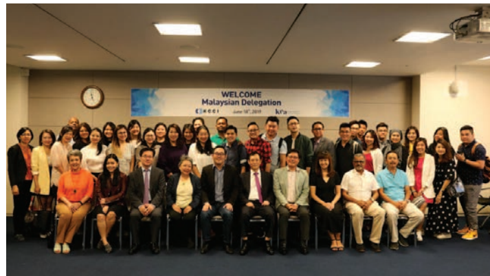
Korea Retail Association provided an informative retail overview