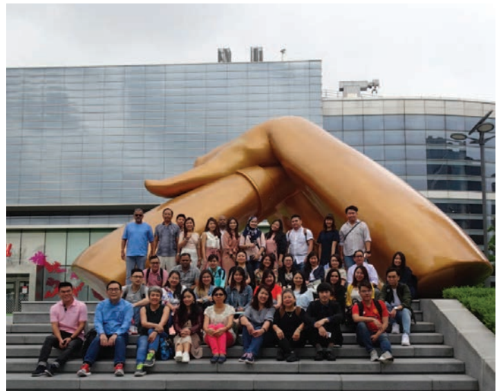
One for the album, entrance to Starfield Coex Mall at Gangnam