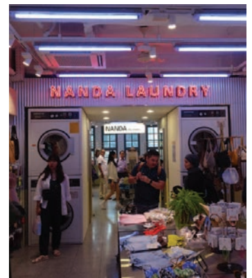
3CE's Pink Hotel by Nanda, with one of the most unusual retail fit-outs