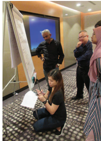
Full concentration on the operations practical case study