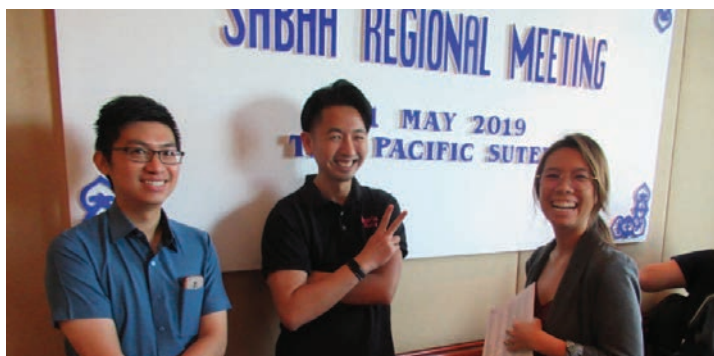
Reconnection of friends during the Kota Kinabalu meeting