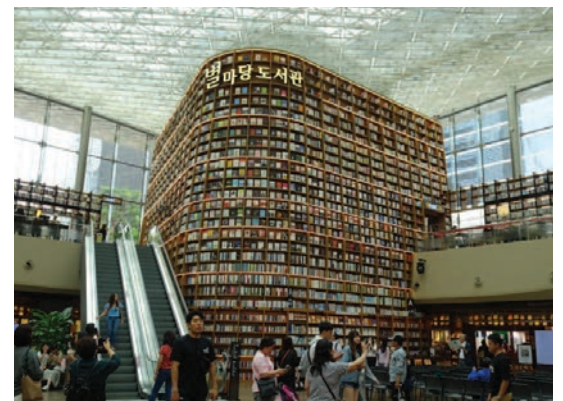
Books, books, books galore