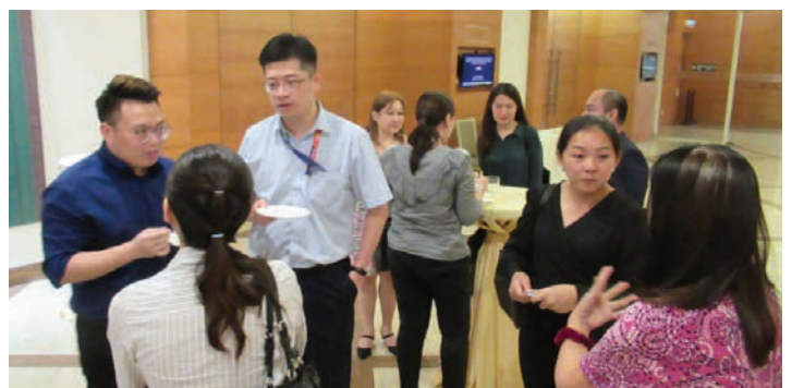
Kuching members networking over tea break