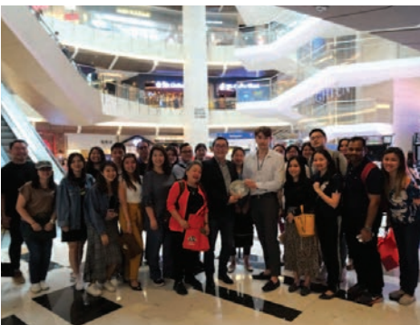
Thank you, ifc Mall for a most comprehensive mall brief and walk-through