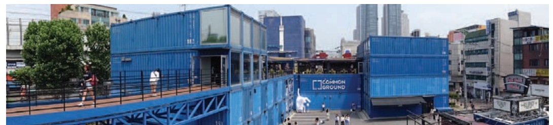
Common Ground, the world's largest mall fabricated entirely from containers, located in one of Seoul's suburbs