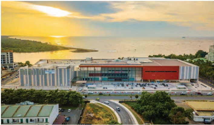
the Spring Bintulu, a regional format mall

Since the Spring Bintulu Shopping Mall opened its door for business on 18 January with an occupancy of 78%, it has attracted over 800,000 visitors to-date. The two-storey mall with gross floor area of 648,014 sq ft is looking at achieving three million footfall in its first year of operation.