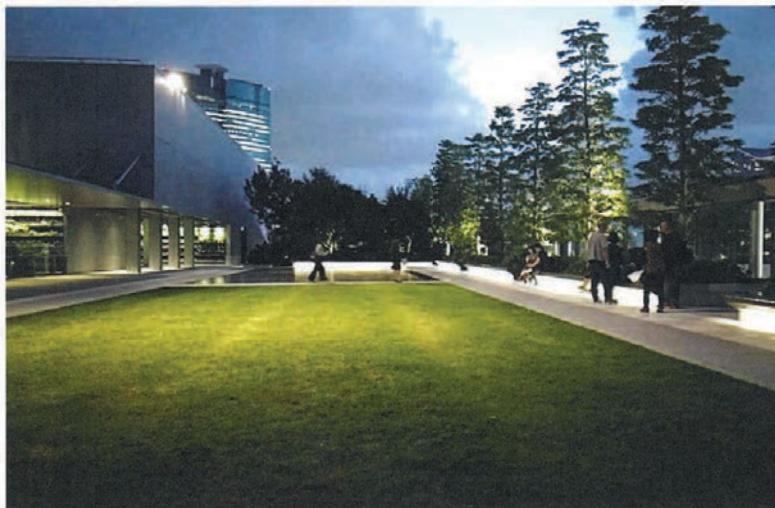
Ginza Six Mall's rooftop park is where shoppers can have a quiet moment to themselves

itable stores such as Dayton's department store and Walgreens within Southdale.