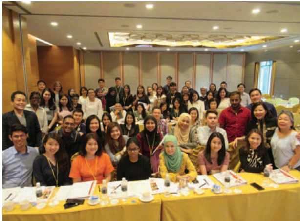
Marketing & Leasing is an excellent programme with experienced speakers and widens our networking