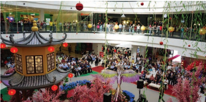
Springtime splendour celebration at the Spring Bintulu

Its chief operating officer Andy Song remarks, "It is the only regional format mall offering prime retail space with a seafront view in the heart of Bintulu." This vantage point offers a panoramic view of the South China Sea from the mall's alfresco area.