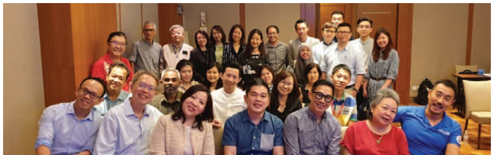
PPKM links malls together within the Northern region