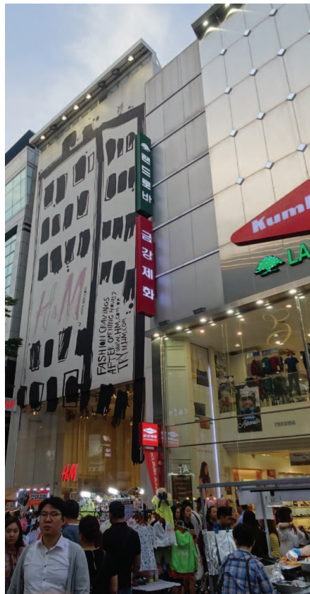
Myeongdong's vibrant shopping street scene