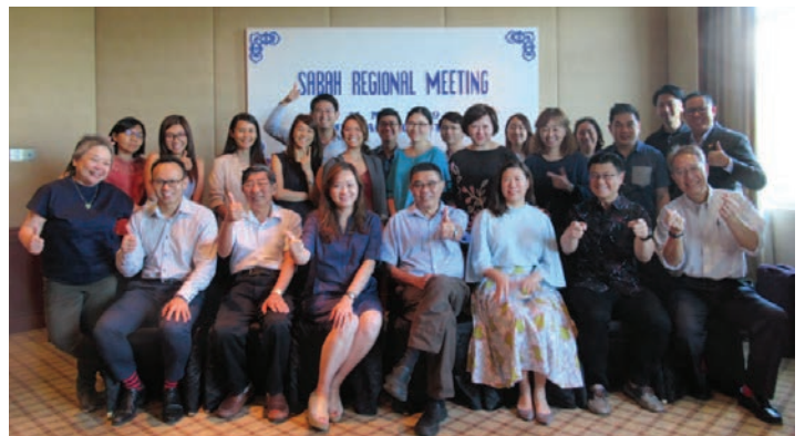
Thumbs up at The Pacific Sutera