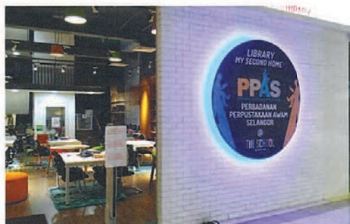
Library @ The School, Jaya One is a public library that offers 5,000 sq ft of space

Our malls are focused on metrics such as achieving maximum net lettable space (that is how many lots there are to rent out) and maximum return on investment. These metrics may blind us to the fact that today's shoppers see the shopping mall as not so much a place to buy things but more a place to congregate and create new experiences together.