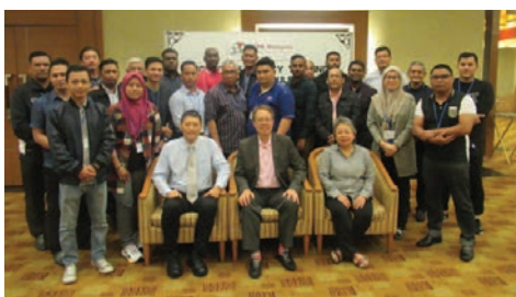
We have all advanced one step further in security and safety

For the first time, 24 participants from malls, including from outstation attended an advanced module in Security & Safety. This was developed following PPKM's mission that all senior security personnel should undertake training for more in-depth and comprehensive practices, with experienced practitioners presenting relevant topics in this very specialised field.