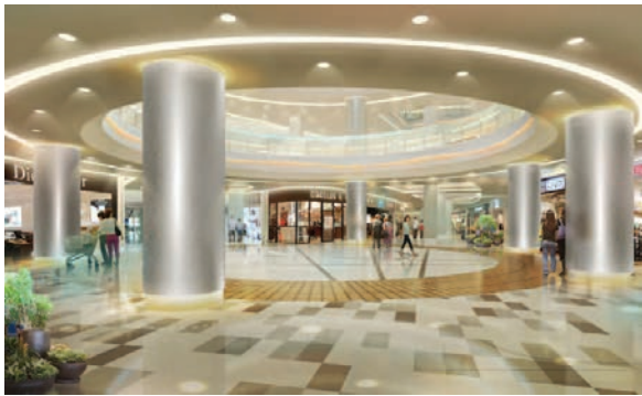
Perspective of the Centre Court on the ground floor

“Brands such as Baskin Robbins, Black Canyon Coffee, Starbucks, Texas Chicken, Johnny Steamboat, Seoul Garden and Mr Dakgalbi from Korea will be among the first to make their entry here. Major retailers will include 7-Eleven, Al-Ikhsan Sports, Focus Point, Swatch, Habib Jewels, The Body Shop, Trio, Gene Martino, Kasut You, Yubiso, Watson, Guardian, Hummer & Pierre Cardin (leather goods), SenQ and SMO Bookstores.