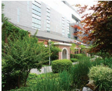
A little green oasis at Times Square Mall