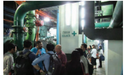
Site visit to Sunway Pyramid