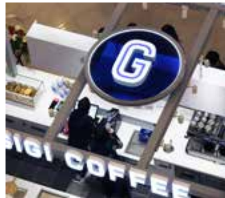
Topview of the outlet at Sunway Velocity Mall, with its visible logo and signages

The café scenario in Malaysia still carries strong influences of Chinese Asian cuisine from Hong Kong and Nanyang. The coffee and toast culture popular