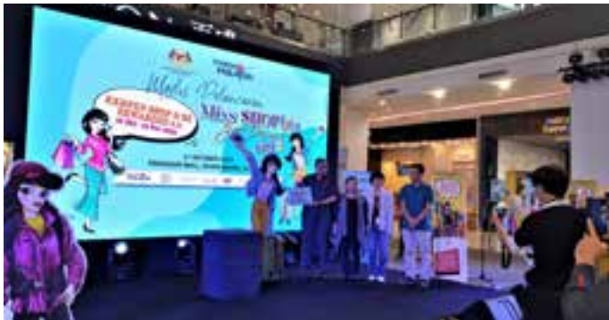
Tourism Malaysia's icon, Miss Shophia goes shopping and travelling

Congratulations to the 23 members who achieved 100% redemption at their malls and we look forward to work together with more malls on future promotions in 2023.