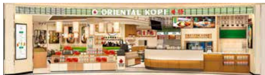
Artist's impression of its latest outlet at Sunway Pyramid Shopping Centre.