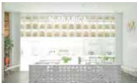
The Pavilion Kuala Lumpur store opened on 26 March 2021

landmark mall within the heart of Kuala Lumpur, which enjoys high footfall from both locals and tourists."