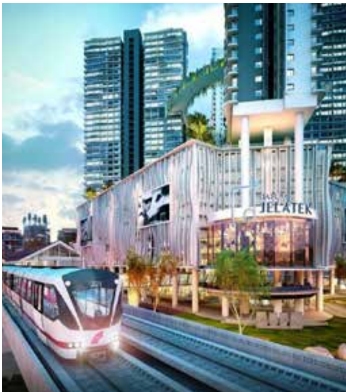
Convenient connectivity to the newly opened shopping centre

D atum Jelatek Shopping Centre has officially launched on 10 December and reached 70% occupancy, enjoying an average footfall of 5,000 daily.