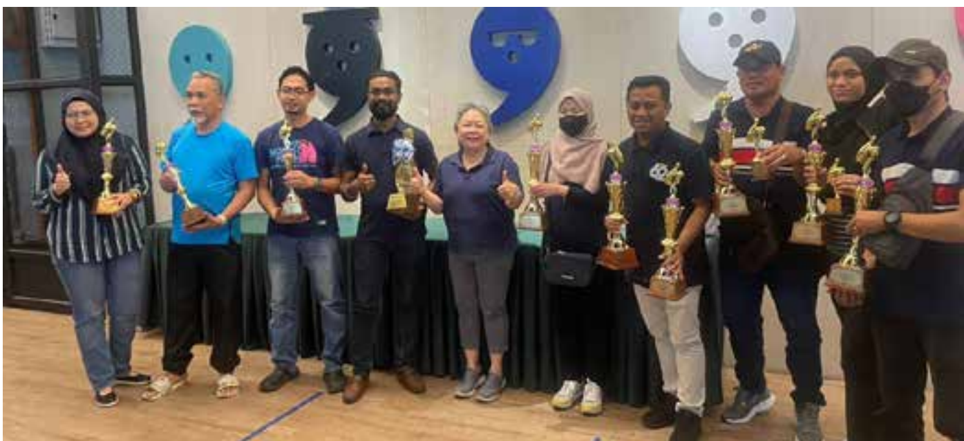
We are all winners!