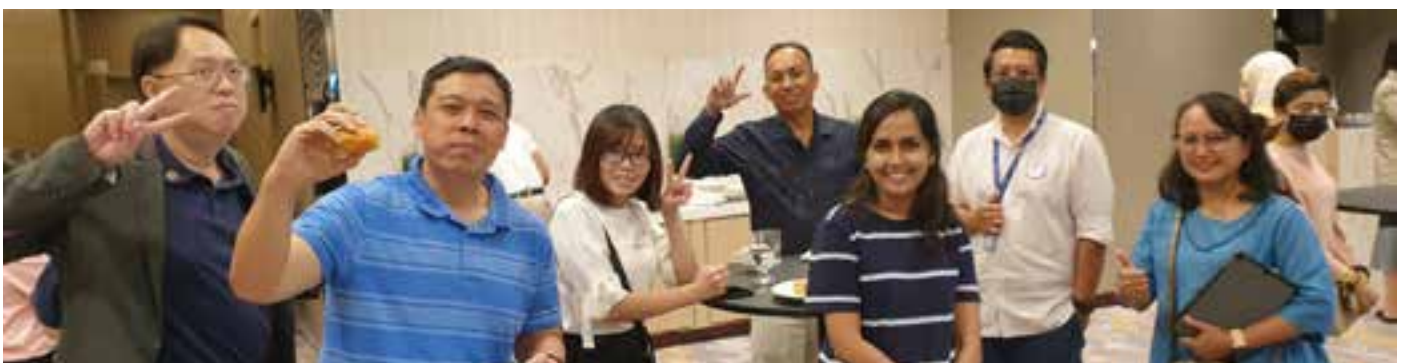
Do join us for a cuppa