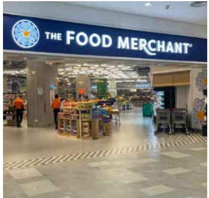
Its main anchor's fourth store opening in the Klang Valley

The Food Merchant, its anchor tenant, occupies approximately 33,000 sq ft. Created to make the lives of shoppers easier, its trolley valet service represents an essential component of the modern shopping experience. Hopefully, this differentiation to their service will enable shoppers, especially Datum Jelatek residents, to buy more.