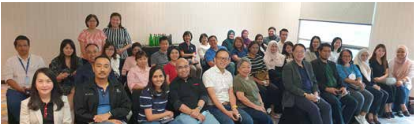
We are Johor malls!