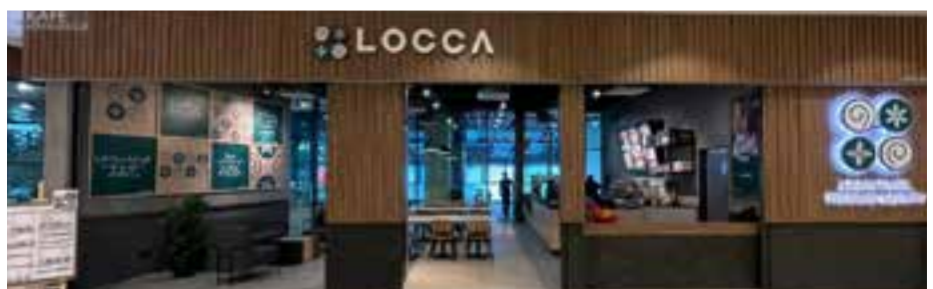
Another franchise café concept

Datum Jelatek Shopping Centre also has an event space Temu Jelatek that is managed by SACC Convec Sdn Bhd, a PKNS wholly-owned subsidiary.