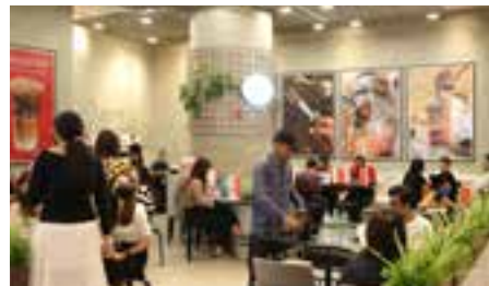
Cosy ambience inside Kenangan Coffee

"Our Kenangan Coffee Training Academy in Uptown, Petaling Jaya, which provides various training programmes for our employees and baristas, is in line with our vision to become a professional food and beverage training centre in Malaysia and the most loved consumer brand in Southeast Asia.