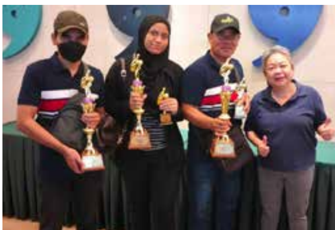
1st runner up - Great Eastern Mall