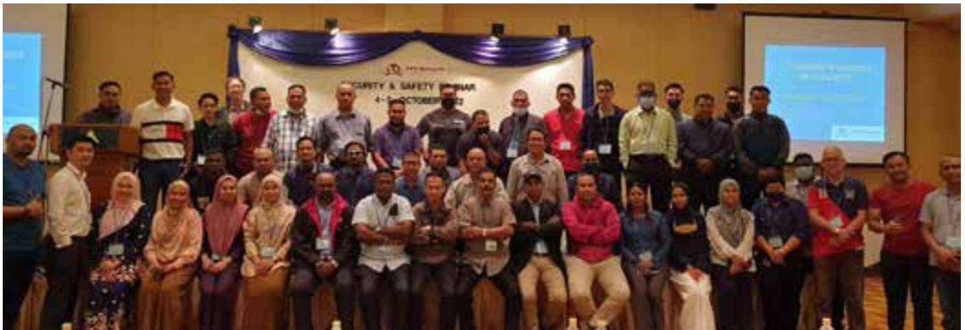
ALL of us certainly found the training both fruitful and useful!

Shopping malls now have to contribute monthly towards the Human Resource Development Corporation (HRDC) and we have applied for and obtained approval for the seminar from HRDC. Therefore, malls took the opportunity to apply for HRDC grants and registered their personnel for the seminar which saw good response from 53 security personnel from numerous malls in the Klang Valley and beyond.