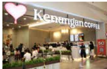
Its attractive logo and interior design pique customers' interest

"Our head of coffee, who is also an award-winning barista, is responsible for procuring and innovating coffee blends from various Indonesian regions that are unique to our brand and offerings. He is also in charge of product development, which includes presenting new menus and exploring coffee farms in Indonesia to curate the best coffee experiences for our customers.