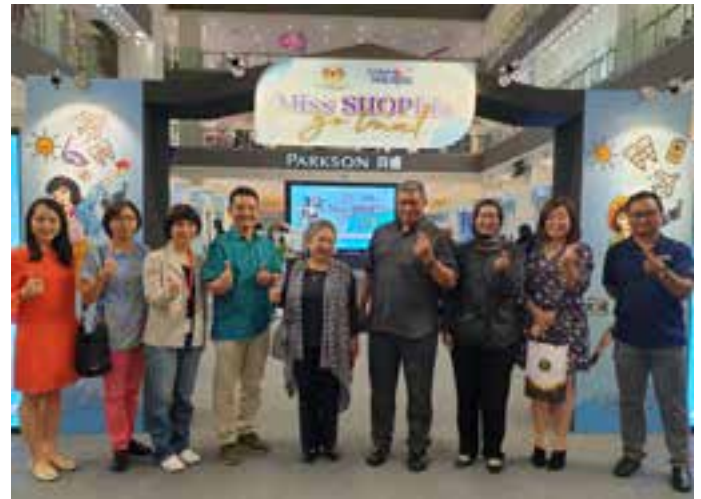
Teams Tourism Malaysia x PPK Malaysia are always upbeat about shopping!