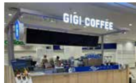
The newly opened outlet at Datum Jelatek Shopping Mall

during the 1960s and 70s was picked up by Toast Box, Singapore’s contemporary coffee chain which has spread its wings here.