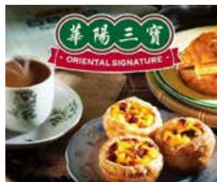
Its aromatic coffee, tarts and polo bun with butter

Meanwhile, it has identified new outlet openings in Pavilion Kuala Lumpur, Suria KLCC, Aeon Mall Tebrau City and City Square Johor Bahru as part of its expansion plans for 2023. Chan estimates a capital investment of RM1.5 million for each outlet.