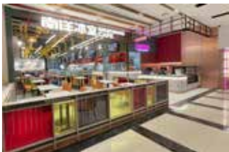
Its attractive branch at Sunway Pyramid Shopping Centre