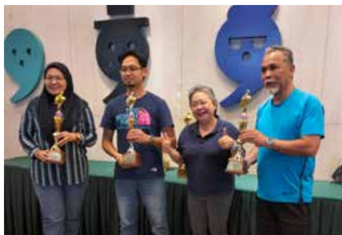
2nd runner up - The Curve