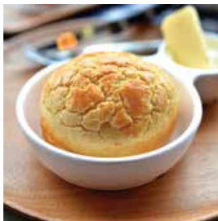
Nanyang Café's signature pineapple bun

"Additionally, the mall players provide the industry with a lot of positive support. Seeing so many similar café concepts coming up lately, this means the market space is still very large."